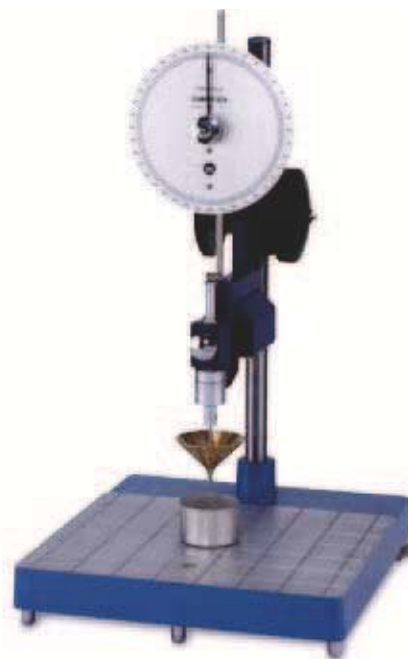
17000-2 (Cone and container supplied separately)