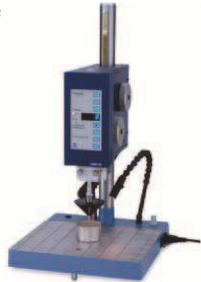
17500-0 (Cone and container supplied separately)